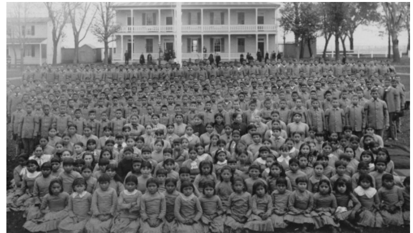
Carlisle Indian Industrial School, Carlisle, PA. Closed 1918.