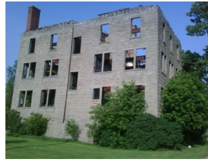
Girls Dorm - 2011