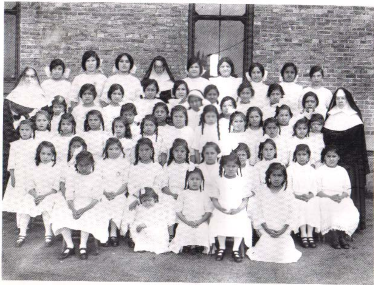
First Communion Class circa 1900. Girls from the St. Regis convent for girls.