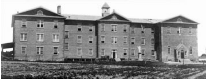
Garnier Residential School, Spanish, ON. Closed 1962