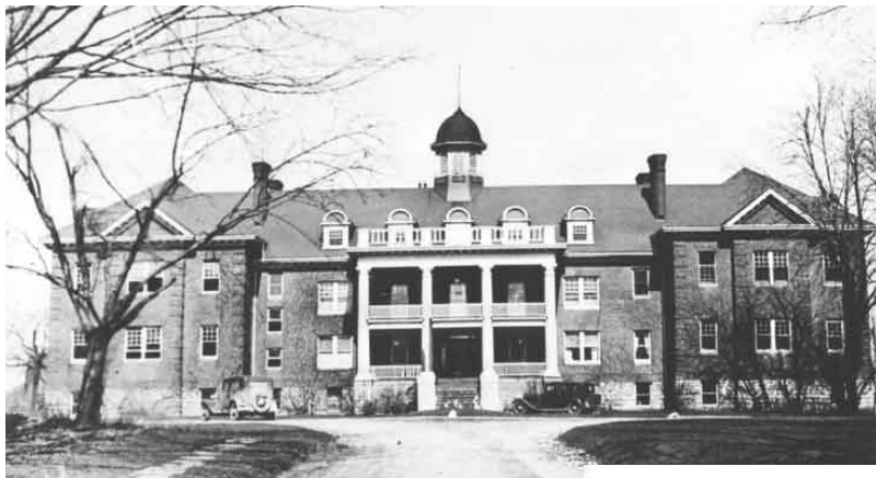
The Mohawk Institute Brantford, ON. Closed 1969.