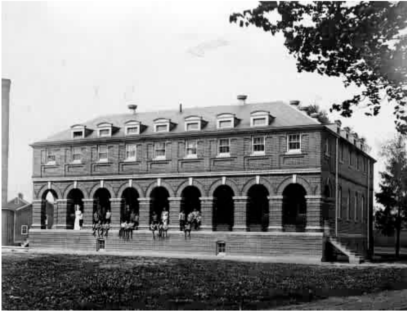
Thomas Indian School, Cattaragus Seneca Nation. Closed 1957.

Convents: St. Andrews West, ON. Cornwall, ON. Montreal, QC.